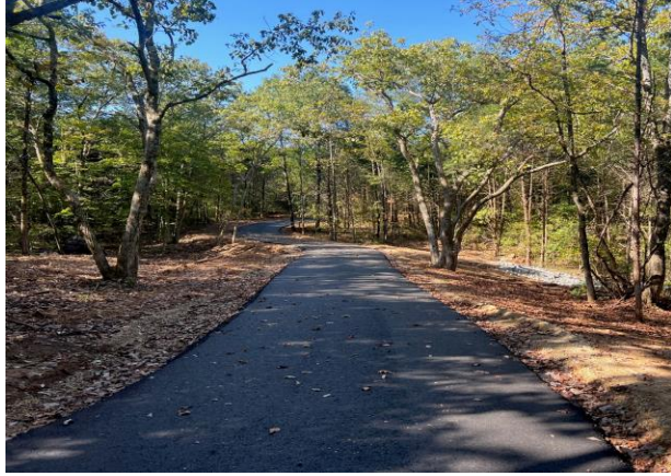
Owl Creek Trail system

Join us for the completion of the phase 1 trail system at St. Francois County's first county park