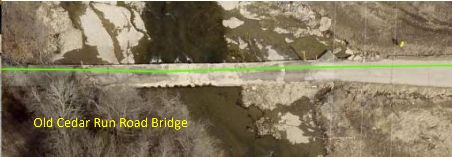
Old Cedar Run Road Bridge

Our people will now pour a concrete deck, sidewalls and otherwise finish the bridge. Hopefully, it will be open for public use in a couple of weeks.